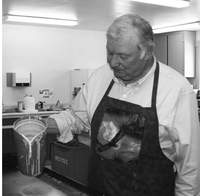
Eagle Watch weekends will soon be upon us, which of course means the amazing community meals will be happening. From pancake breakfasts in Sheffield Mills to bean suppers in Kingsport, Eagle-watch is great family fun.

As a journalist, I spend a great deal of time reading, both print publications and